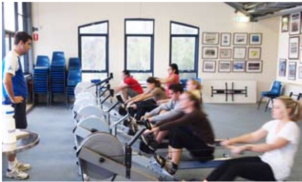
Thanks to all the learn to row coaches for passing on their wisdom and experience - here are just a few of them.