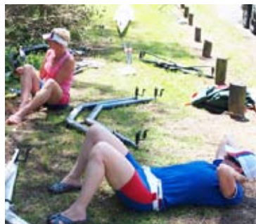
Teamwork came to the fore at the Shoalhaven, even when resting ...