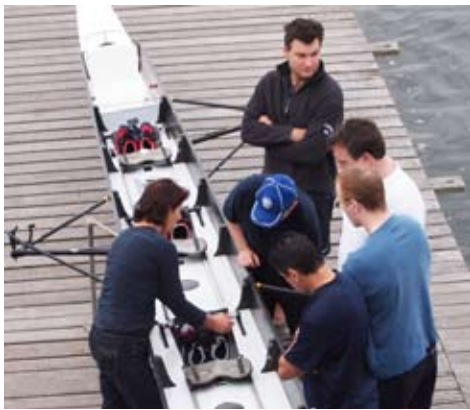
The photo on page 5 shows what can follow a chance meeting at learn to row.