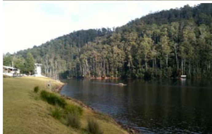
The Lake Barrington course, from start (top) to finish (above)