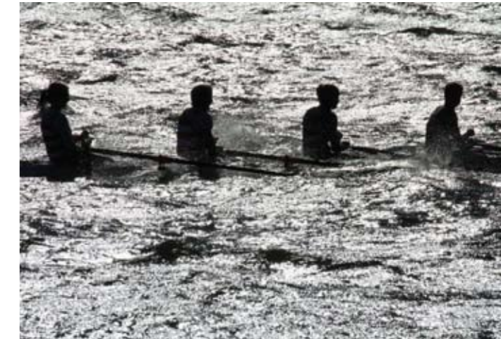
Where's the boat - again?