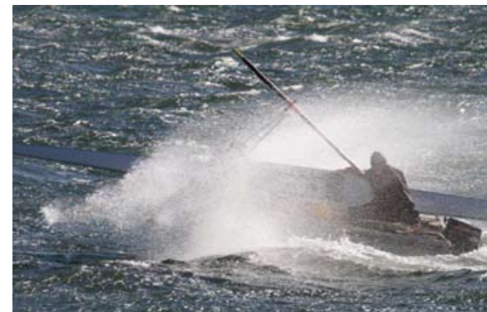
Bringing in a single - pity the person in the stern of the tinny!