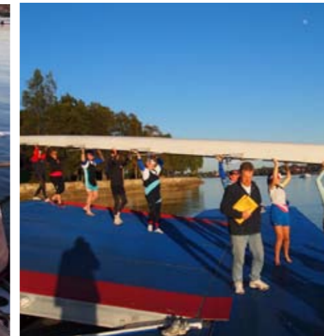
The crew, the photographer, the organiser and the moon.