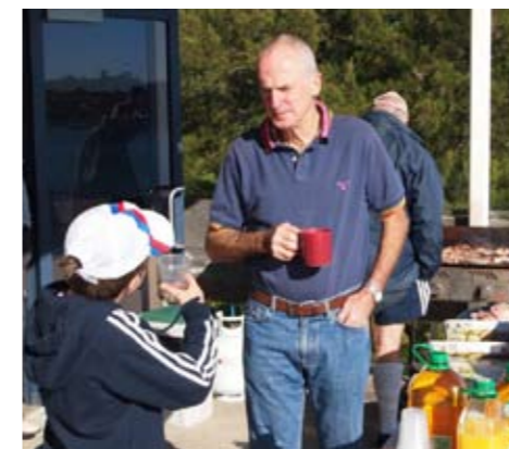
The coxswain, the tactician and the chef.