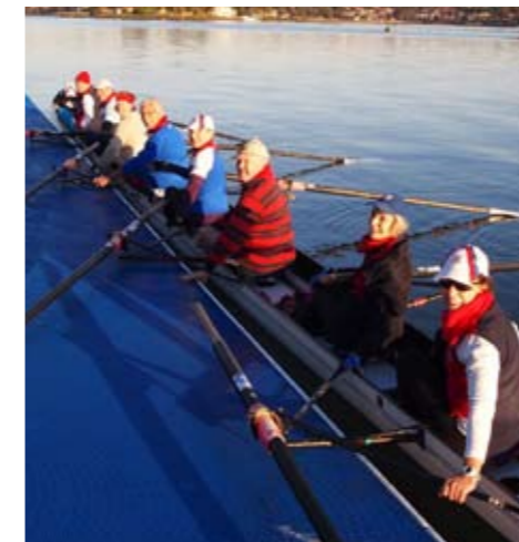
The reds at the ready.