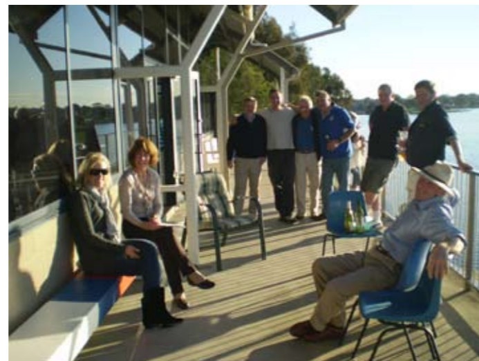
(Above) Post-lunch reminiscing on the balcony, and (R) Balcony Boyz and Gals