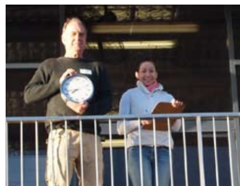
The timekeeper and his time; the recorder and her record. See page 5.