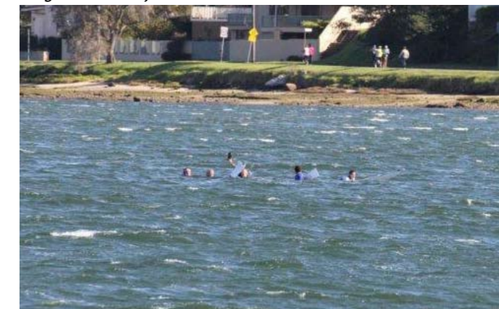
'I'm sure there's a boat in here somewhere ...'