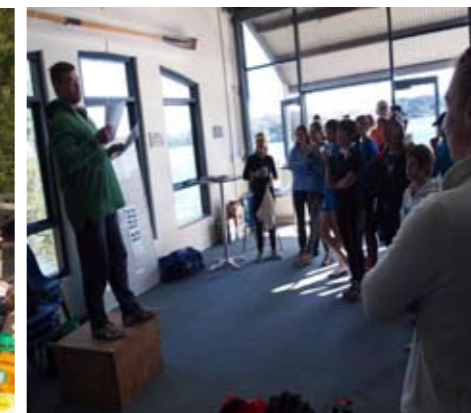
The captain enlightens the multitude.