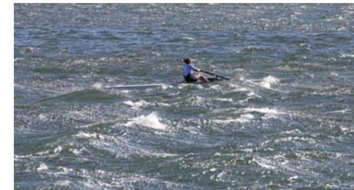
Tough conditions for the U16 1x.