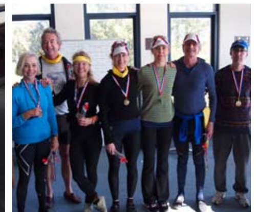
The yellows: winners are grinners.