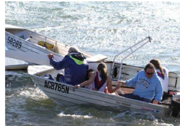
A rescue mission completed safely