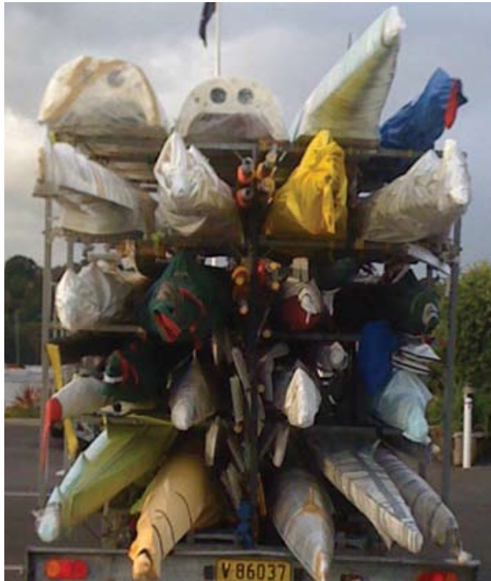
Ready to leave Sydney

G'day all back 'ome! Peter and I just arrived in Kalgoolie after another 14 hour day and 1000 kms at our sedate pace of 78 kms per hour.