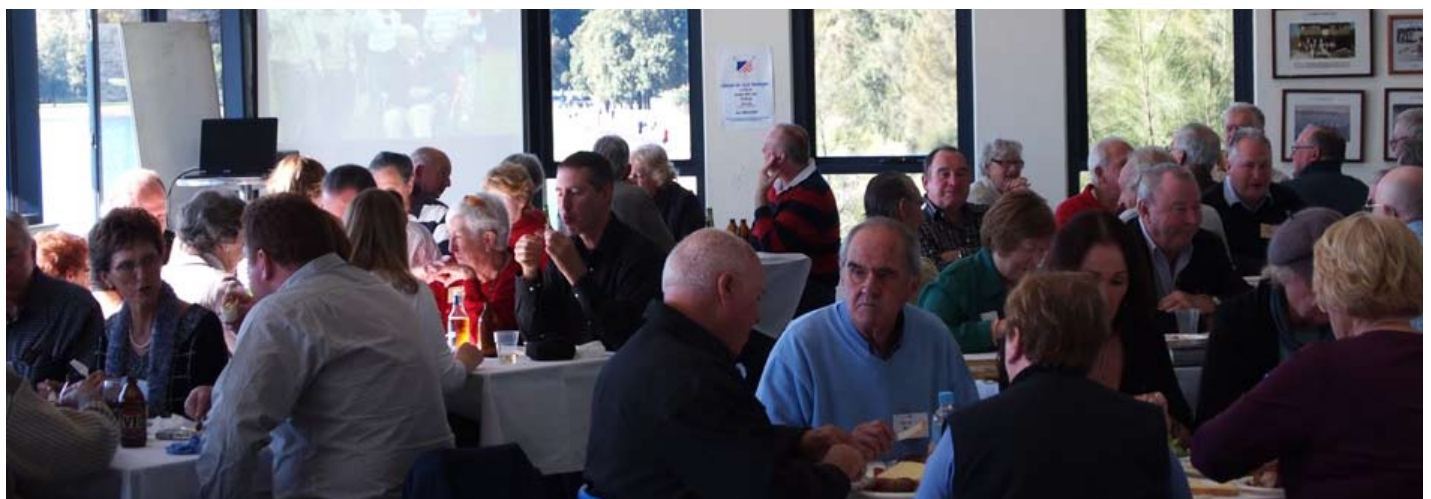
Lunchtime discussion, with the 'film' playing in the background