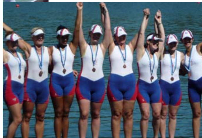
Celebrating bronze in the WD8+