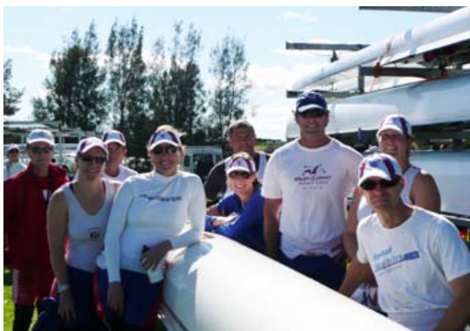
The young Mixed 8+