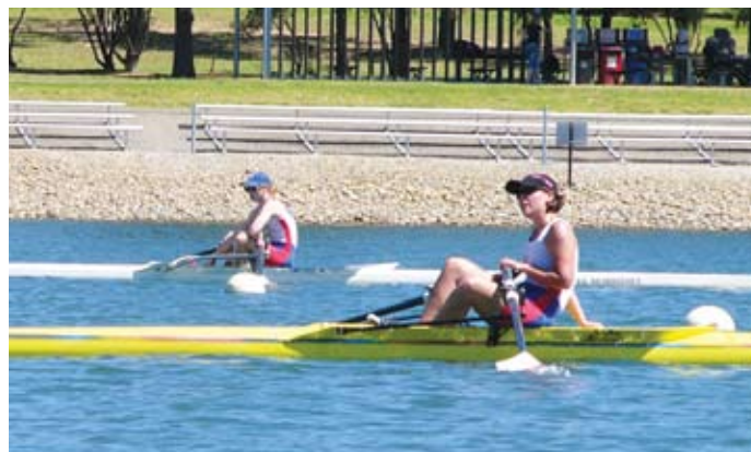
2ks can be a long way in a single - at the Spring regatta

The 3rd NSWIS Time Trial had a cut off at 77.5% prognostic speed – 30 rowers survived, four of them from LRC in the senior event, and seven survived, two from LRC in the junior event.