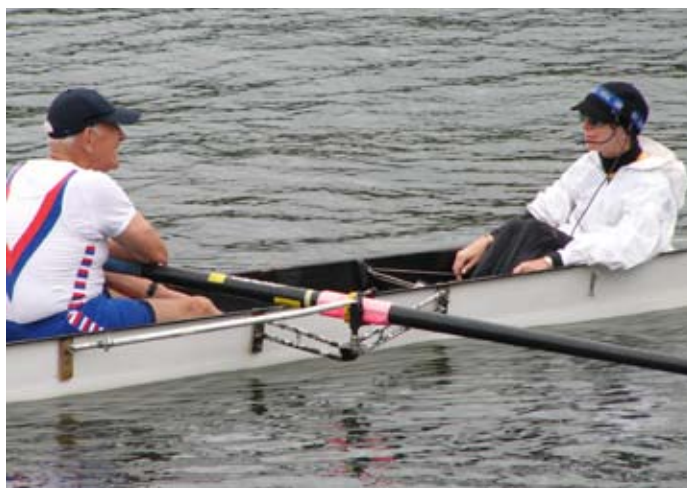
After the Head of the Shoalhaven

Saturday morning changeover times are at 6 am (getting on the water), 8 am (changeover), 10 am (changeover) and 12 pm (getting off the water).