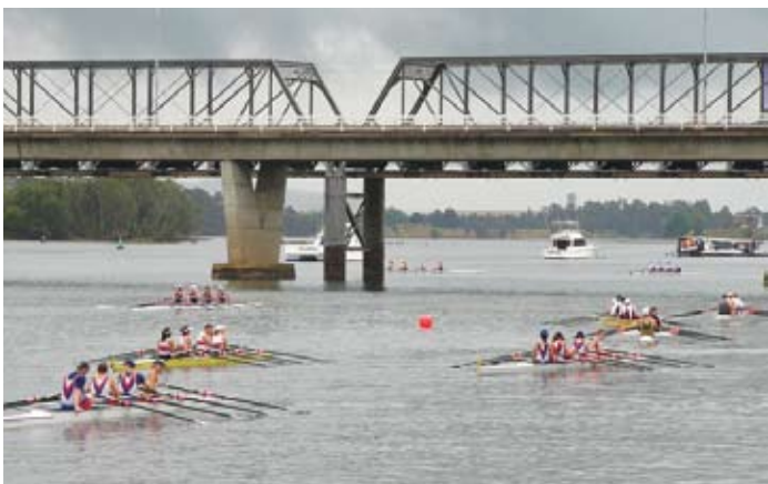
and when the hard work is over ...