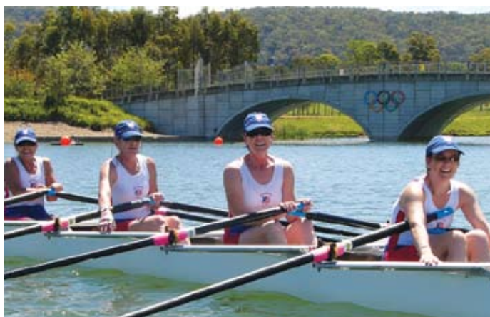
Smiles all round for the second-placed WD4x at the Spring regatta

Leichhardt's winning form continued in the sprint regatta, with four wins (MD1x, MC2x, MB4-, MB4x and WC2x), and five seconds.