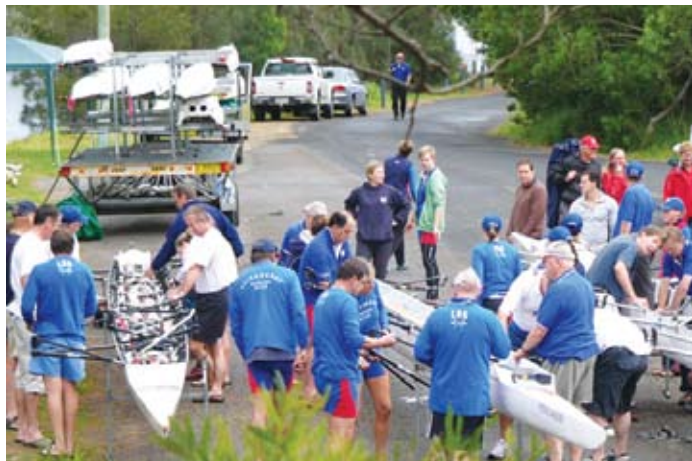
Before the races ...