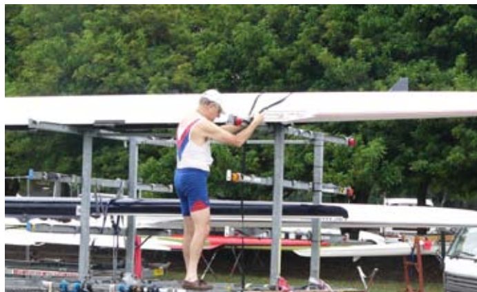
A delicate balance