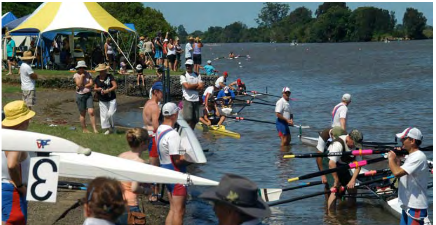
Taree 2010 - see more photos inside