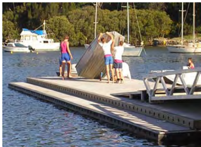
The pontoon at St Josephs

Note: Areas of the blue rubber surface close to the edges appear to be getting damaged by riggers scraping along the surface or riggers being stood on whilst getting in and out of boats. Please take care not to scrape the riggers on the pontoon surface and no one should stand on any riggers to steady the boat. All riggers should be held by hand to keep the boat balanced and steady. All members are asked to observe and police this request. Don't drag tinnies - lift them, and only put them in the water where the pontoon edge is black.