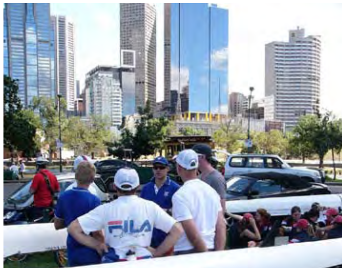
More words of wisdom