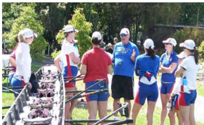
Frank's disciples. The latest in a memorable series of photos of Rex's eight at the Head of the Yarra.